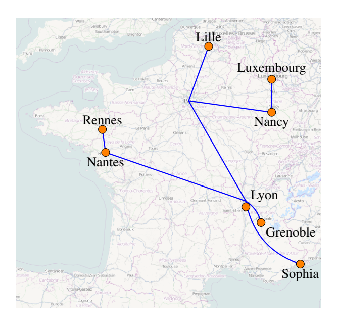
Figure 1. Grid'5000 sites and interconnection network